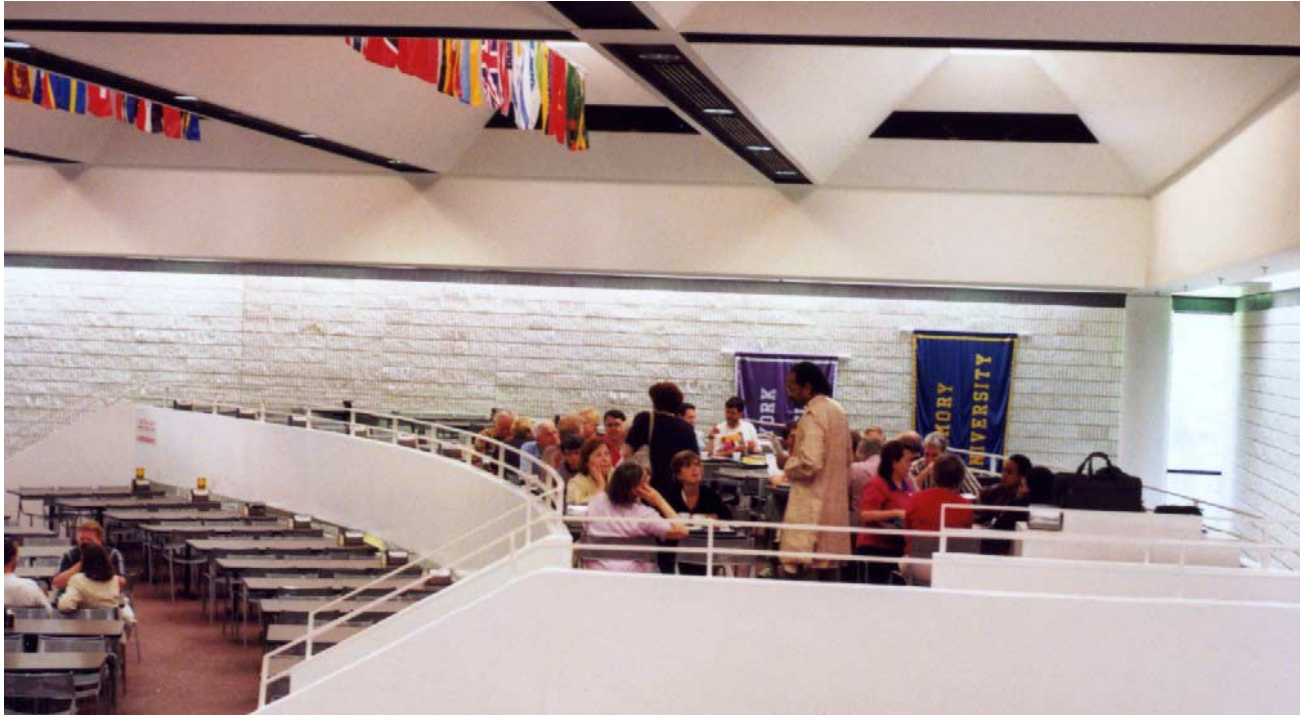
University Center, the dining place