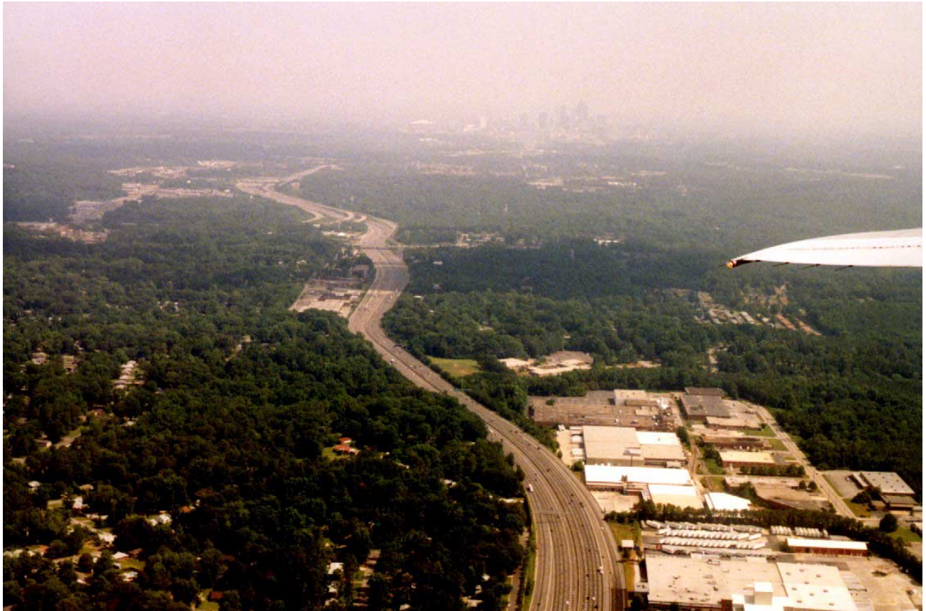
Downtown Atlanta in the foggy distance